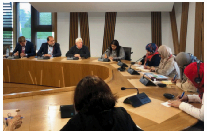
UN Special Envoy to Yemen, Martin Griffiths with his Women's Technical Group and fellows at the Scottish Parliament