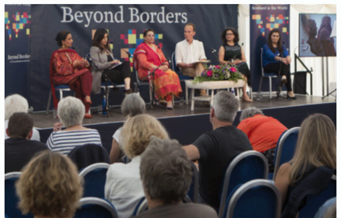
Fellows on stage at the Beyond Borders International Festival