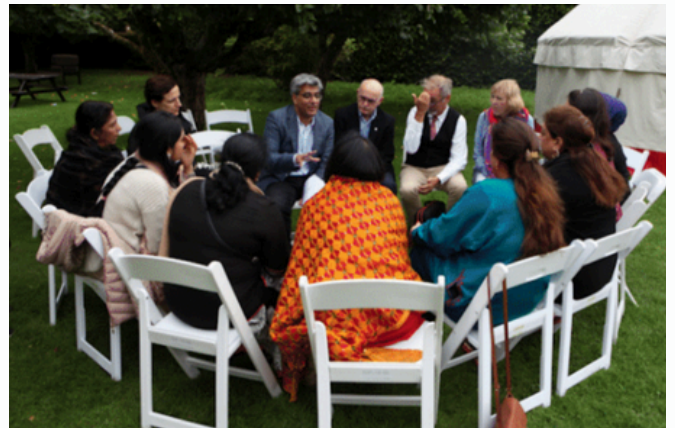
Fellows at the Beyond Borders International Festival with U.S. Official Salman Ahmad